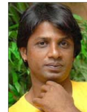
Sri Duniya Vijay Cine Actor