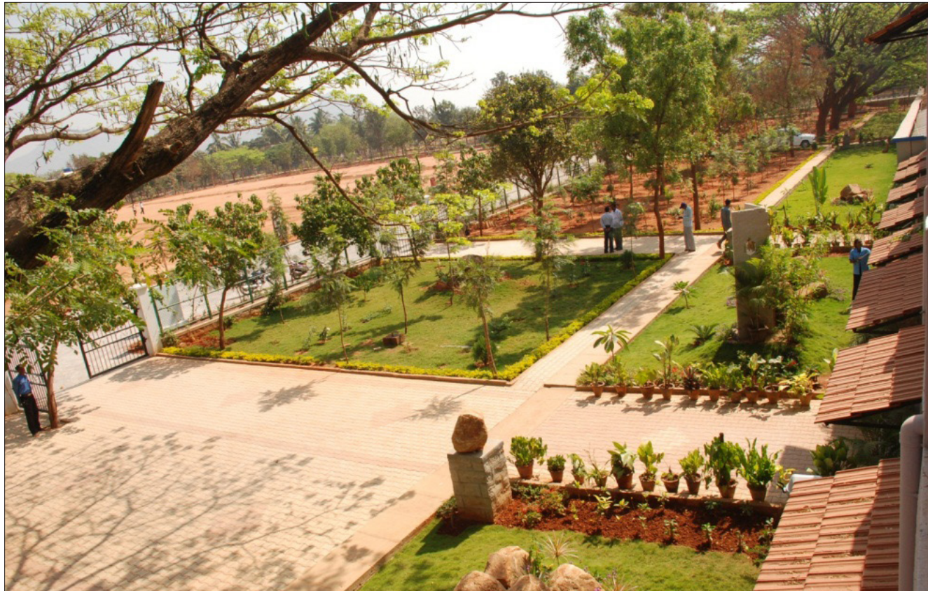
The lush green park in front of the administrative block.

Through its various research projects, the university has acquired the most advanced scientific equipments for its laboratories which will be a boon for its researchers. The university has more than 50 unique equipments such as the advanced XRD equipment worth Rs 60 lakh, remote sensing and GIS software worth Rs 20 lakh and FFIR spectrometer worth Rs 15 lakh. The university has the credit of successfully utilizing the Rs 1 crore fund released by