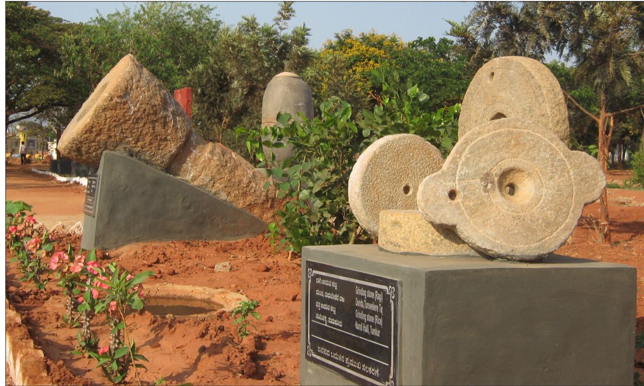
Rare artifacts and installations at the Monuments Park of Tumkur University.

The Monuments Park in Tumkur University is a unique experiment in installation archeology. Ancient stone monuments, inscriptions, war memorials, idols and statues, found in different degrees of decay and degradation across Tumkur District have been collected, curated, conserved and installed in a landscaped park. The Monuments Park was developed as part of the Kannada Bhashabhivruddhi Yojane. The park also contains inscriptions and epithets