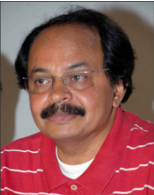
Nagathihalli Chandrashekhar Writer and film maker