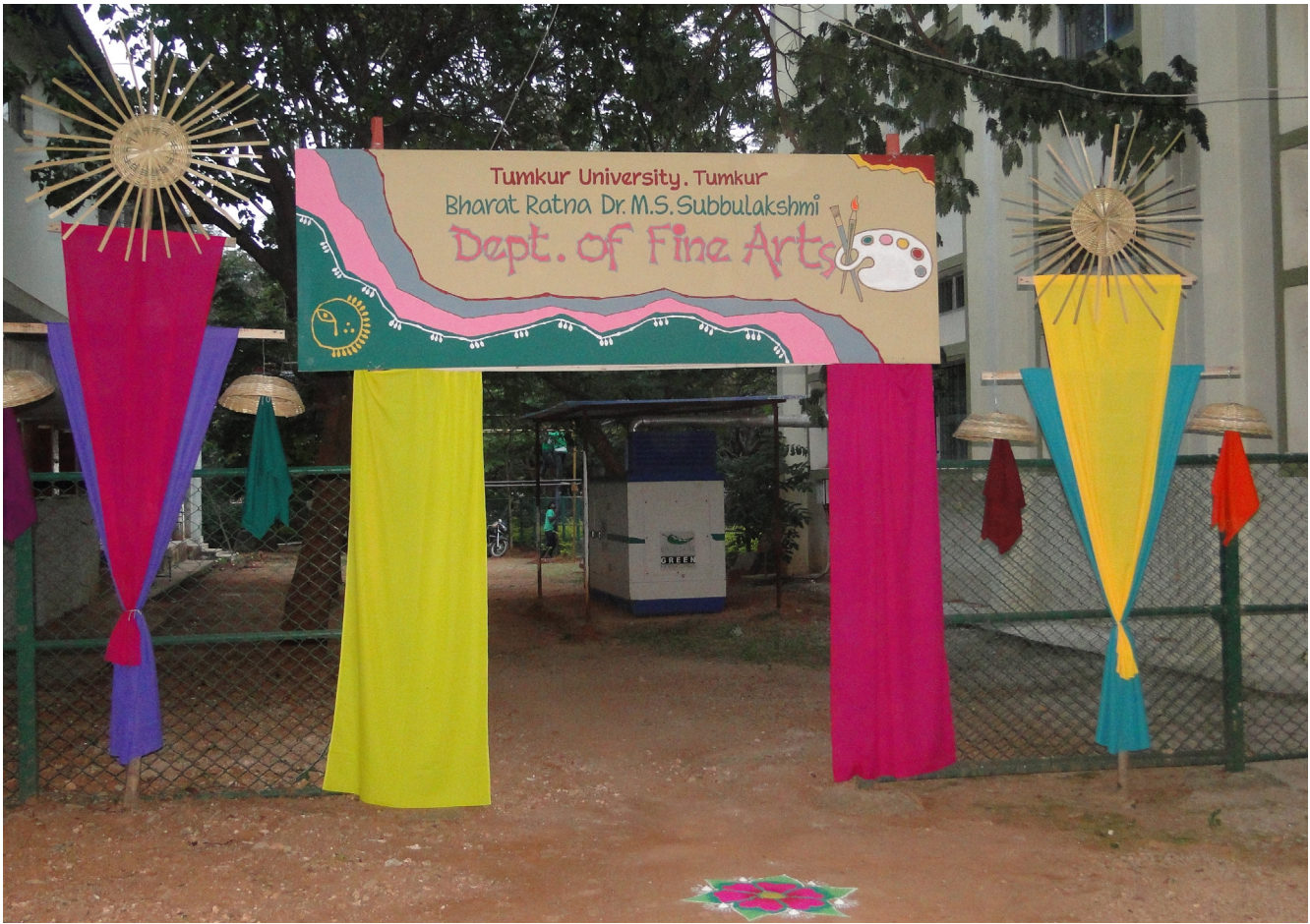
(Above) The beautiful art works designed and arranged by the students and faculty members of Bharatratna Dr. M. S. Subbulakshmi Dept. of Fine Arts. (Below) The entrance of the Dept. of Fine Arts welcoming the delegates.