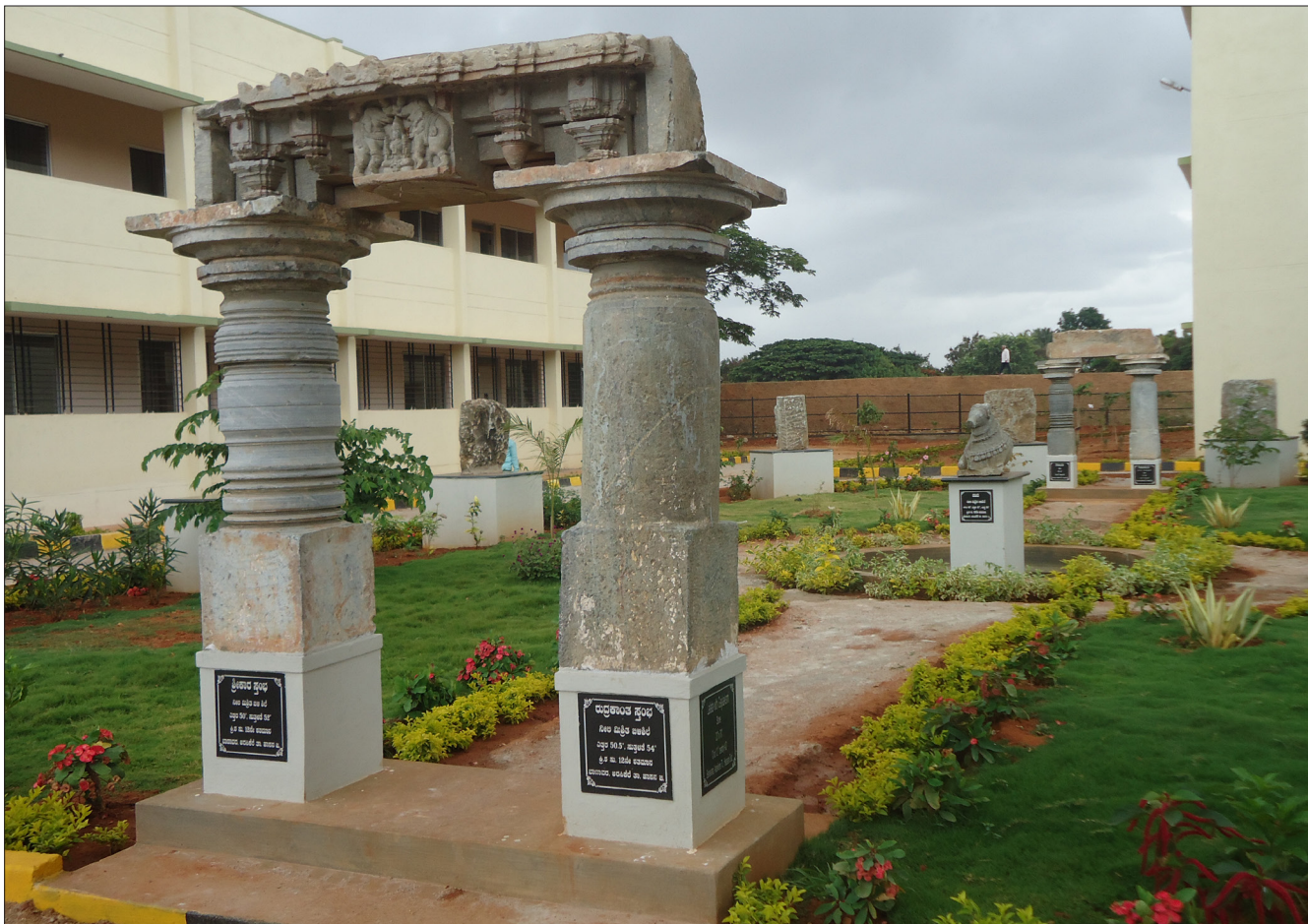
The entrance of the Open Sculpture Gallery at Tumkur University.

The university has evolved PhD programmes as per 2009 UGC regulations. The university offers PhD programmes in Kannada, English, Hindi, Sanskrit, Economics, Political Science, Sociology, History, Buddhist Studies,