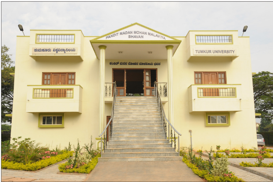
The majestic Pandit Madan Mohana Malaviya Bhavan.

In 2012, the University was recognized under section 12(b) of the UGC Act, 1956. In the same year, the National Assessment and Accreditation Council (NAAC), an inter-university council of the UGC, accredited the University with “B” Grade in the three-grade rating scale. Besides, the UGC has recognized Tumkur University as “an educational institution of national eminence” and has recommended that the donations made to the university can be exempted from income tax u/s