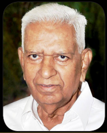
Shri. Vajubhai Vala

■ 9,853 candidates to receive degrees ■ K. Kasthurirangan to deliver Convocation Address