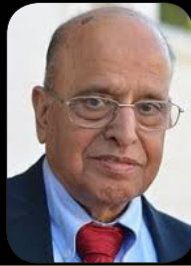
Dr. K. Kasthurirangan