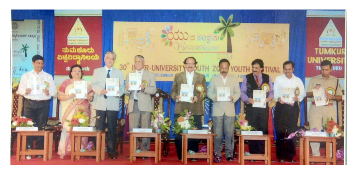
Release of Information Booklet

Yuva Sambhrama -2014: 30<sup>th</sup> Inter University South Zone Youth Festival National Cultural Completions were held between 8-12-2018 to 12-12-2014. Totally 21 Universities from southern part of India including 715 participants took part in this programme.