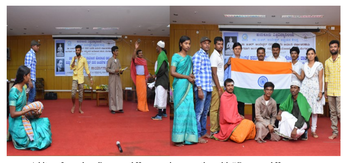
A kit performed on Communal Harmony in connection with "Communal Harmony Fortnight", held on 1<sup>st</sup> September, 2017.

Inauguration of Communal Harmony Fortnight Programme was inaugurated by Prof Jayasheela, Vice Chancellor (In Charge) on 1<sup>st</sup> September 2017 at 10.00am. Government of Karnataka issued an order to organise "Communal Harmony Day" on 19.08.2017 and to organise programmes on "Communal Harmony Fortnight" from 20.08.2017 to 02.09.2017. In relation to the same on 19.08.2017 Communal Harmony Day was conducted and students were made to take oath on maintaining communal harmony in their personal life. On 1<sup>st</sup> September 2017 a skit was performed on Communal Harmony in connection with "Communal Harmony Fortnight". All the students of the university participated in the programme which took place in Vishweshwaraya Auditorium.