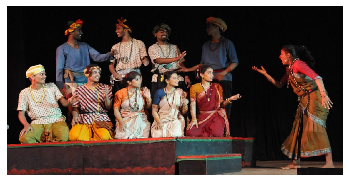
A Scene from Folk Play "Mahamaaye" written by Chandrashekar Kambar and performed by Alvas Adhyan Kendra held on 6^{\rm th} October, 2017