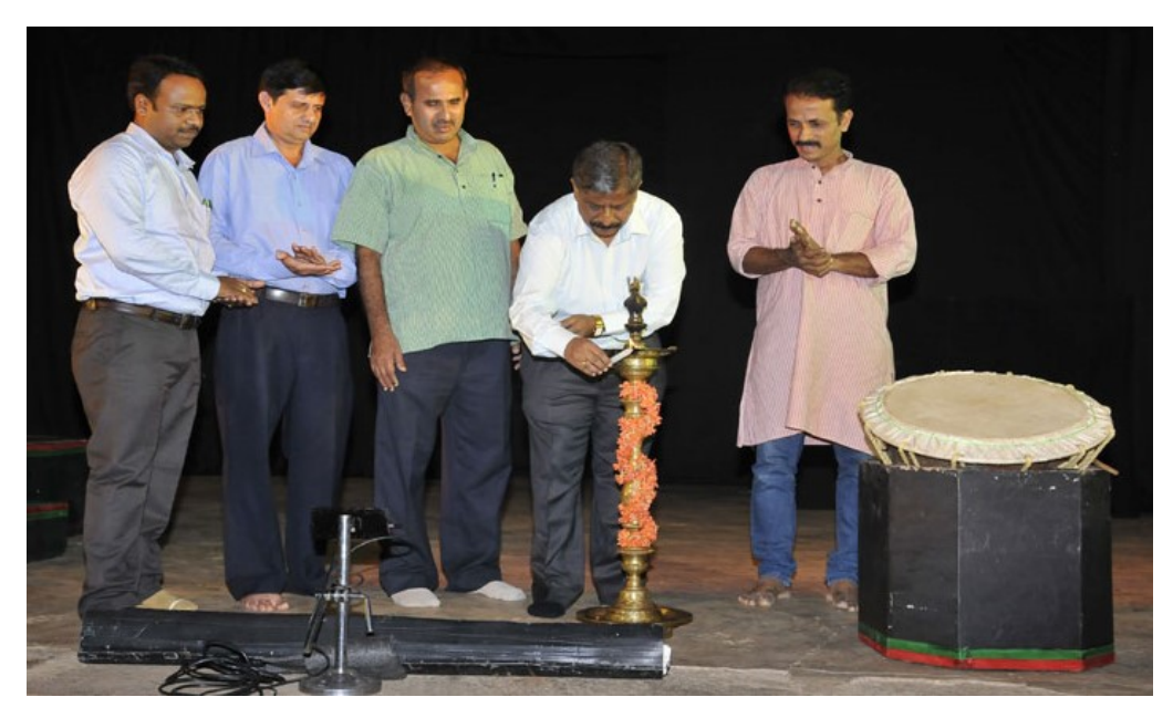
Inauguration of Folk Play "Mahamaaye" performed by Alvas Adhyan Kendra held on 6^{\rm th} October, 2017

open to public and students and more than 800 audiences watched the play and appreciated the way it is written and the way it was enacted.