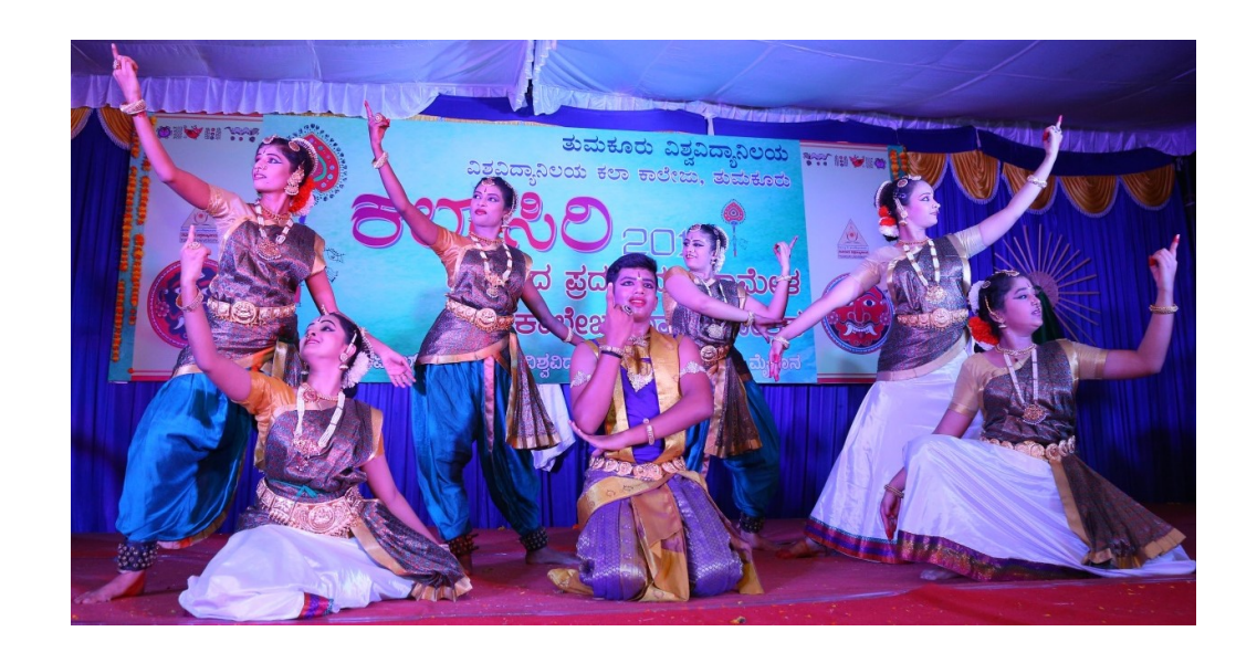
Performance of Bharat Natya at "Kalasiri- 2017" conducted by Constituent College.