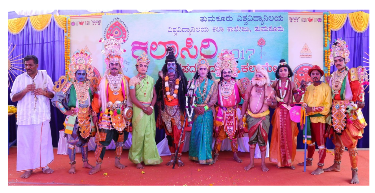
Various Artists participated in "Kalasiri – 2017" conducted by Constituent College.