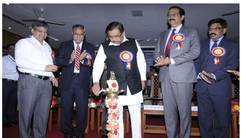
Inauguration of 'Anveshan- Student Research Convention by Hon'ble Home Minister, Government of Karnataka held on February 14, 2017.